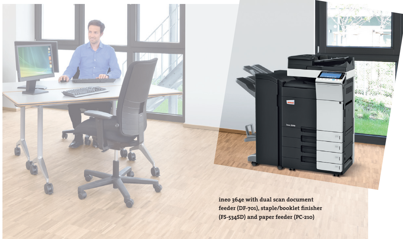
ineo 364e with dual scan document feeder (DF-701), staple/booklet finisher (FS-534SD) and paper feeder (PC-210)

These black-and-white systems come with a number of energy-saving features that cut power consumption by over 40% compared to predecessor models. While this kind of economy saves money, other green features are ecologically beneficial. And that means DEVELOP's ineo e line-up is not only good for the environment but also boosts the owner's green credentials.