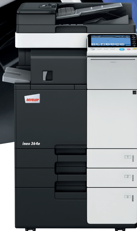
ineo 364e with document feeder (DF-624) and large capacity tray (PC-410)